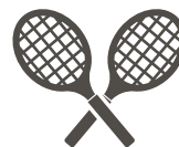
Squash & Tennis Court