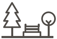
Town Square Park