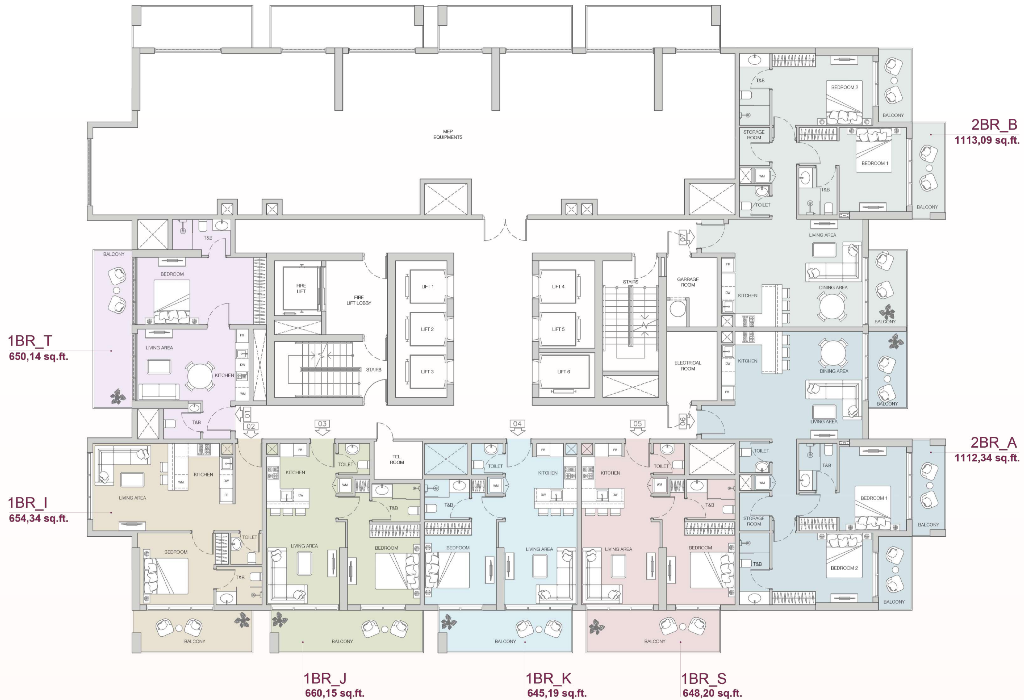
TYPICAL 18-19 FLOOR PLAN