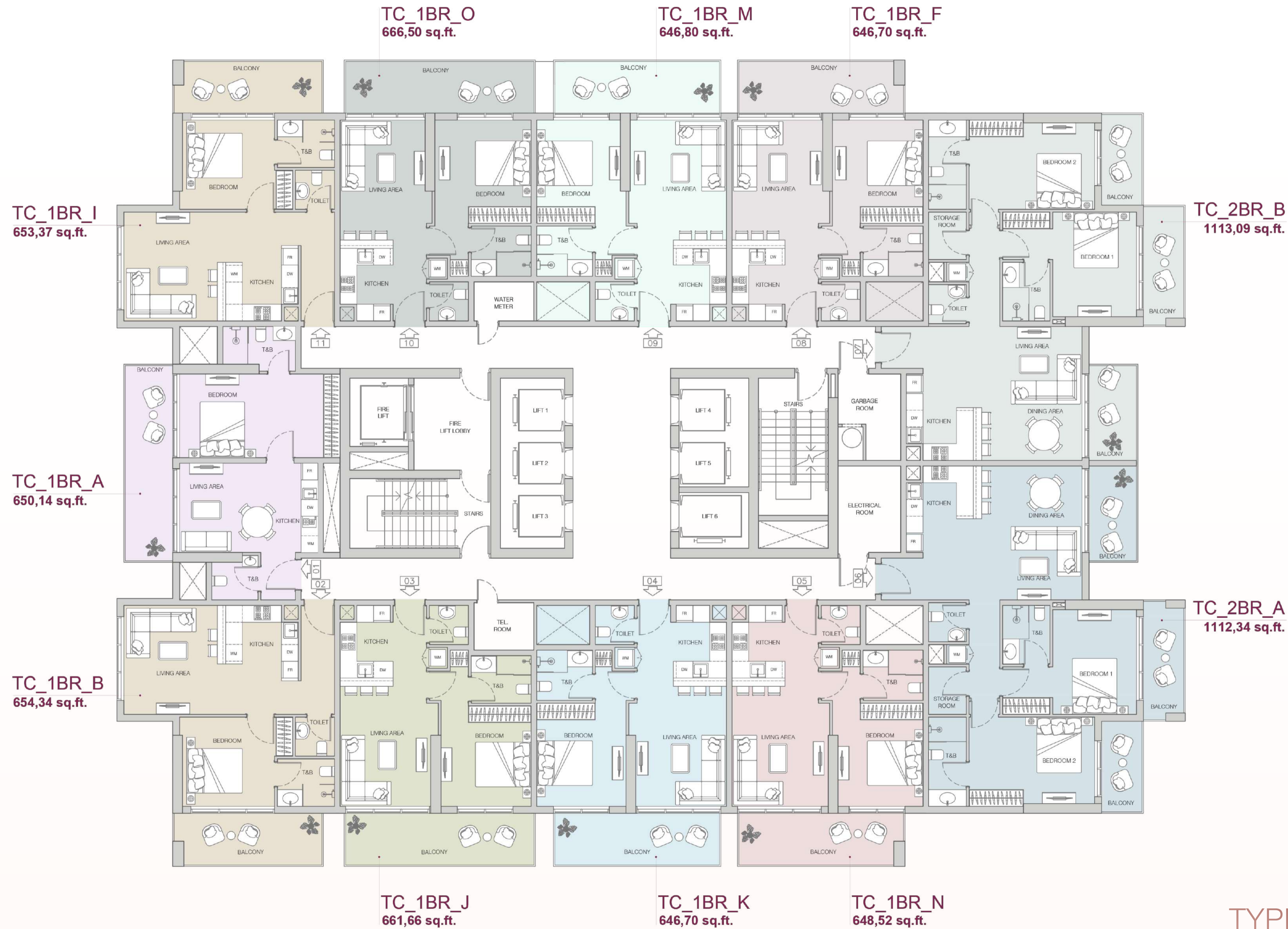
TYPICAL 24-26 FLOOR PLAN