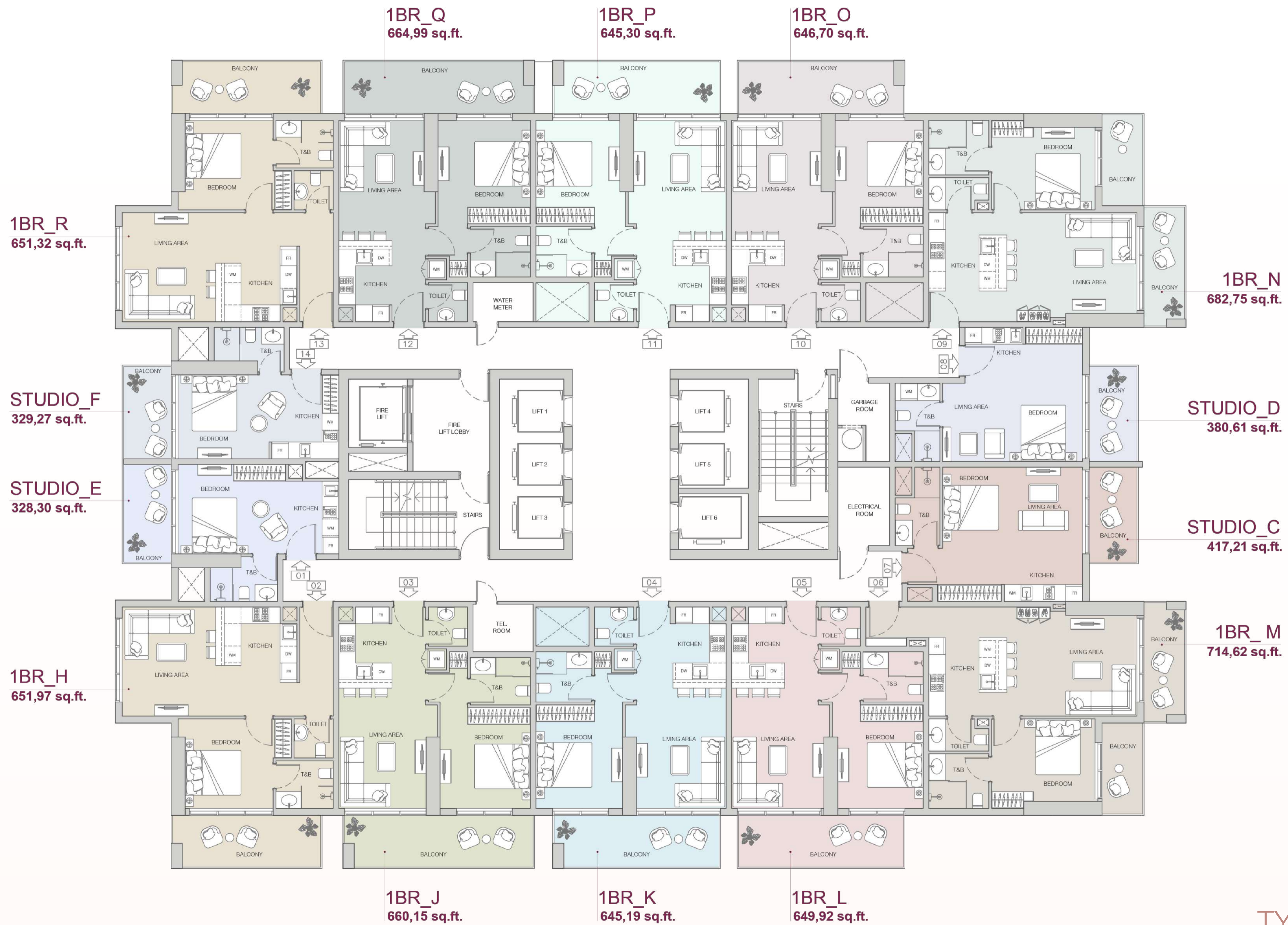
TYPICAL 2-5 FLOOR PLAN