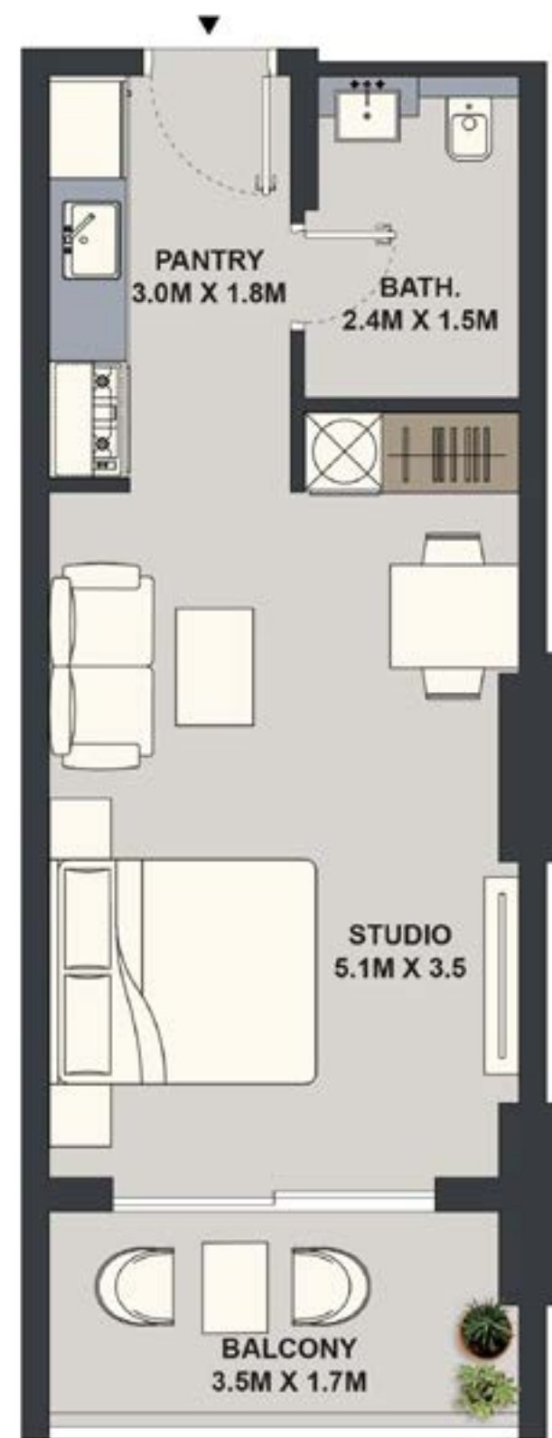
STUDIO - TYPE 1