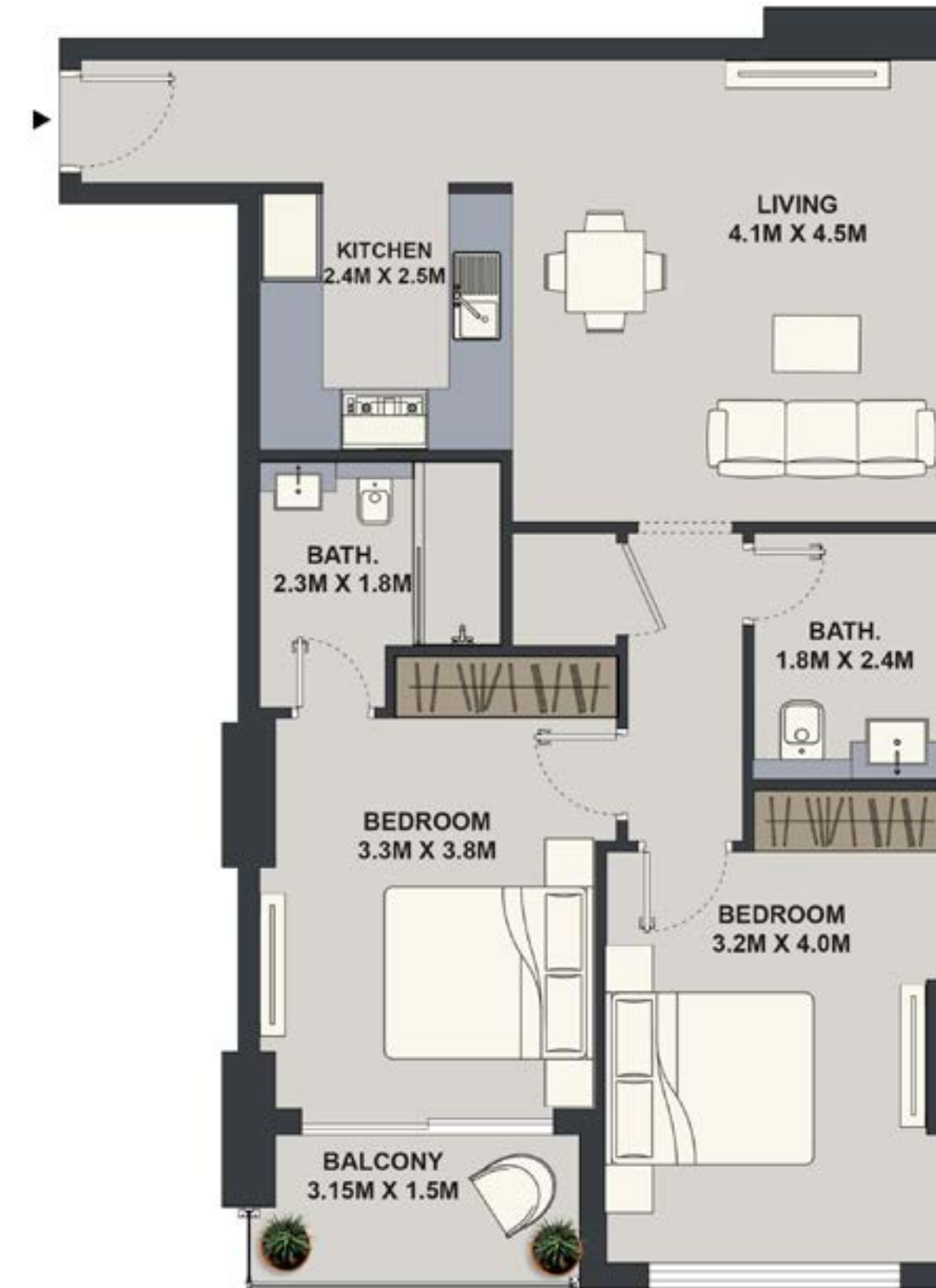
2BHK - TYPE 1