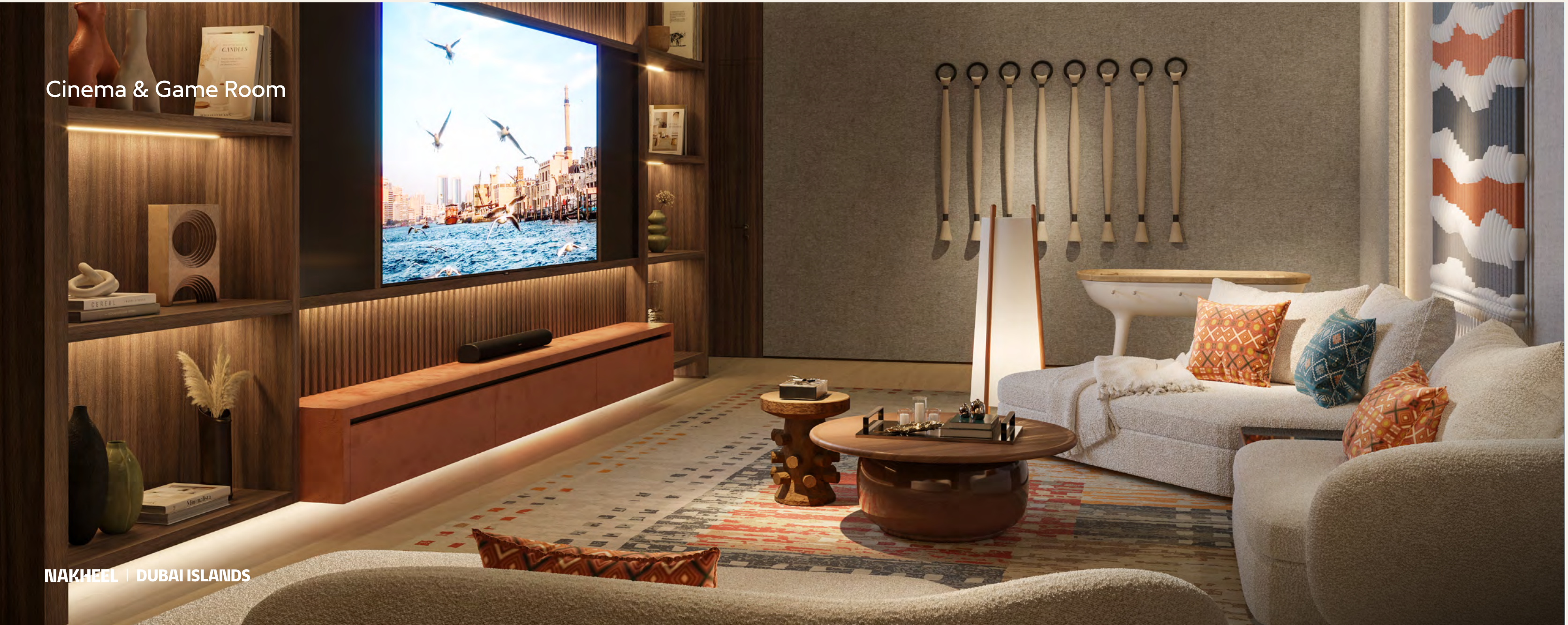
Cinema & Game Room

Adjacent to it, the cinema room provides a cosy retreat for movie nights, private bookings, or casual get-togethers.