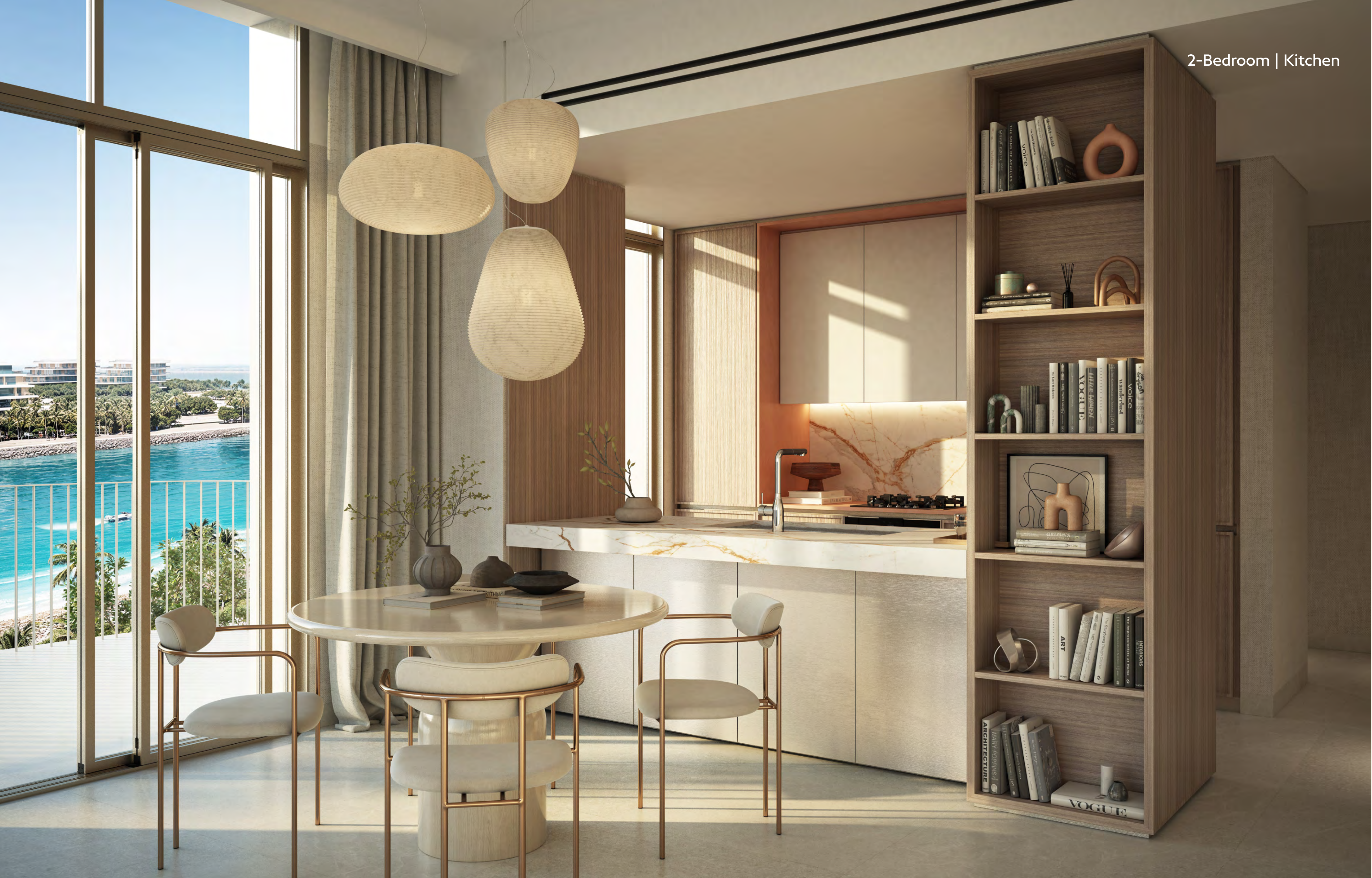
2-Bedroom | Kitchen